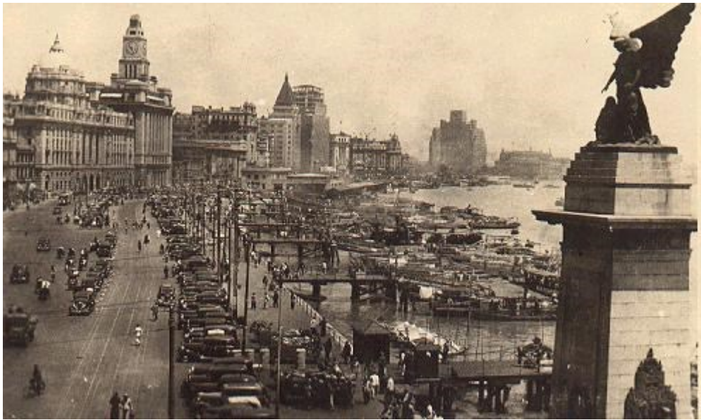
Old Shanghai and the Bund.

Shanghai has the most amazing cityscape. It is almost something out of a science fiction film. For dazzling architecture you may see the huge Jinmao Tower, visit Yuguang Gardens and bazaar, Huzhou pagoda, and take a stroll around the back alley communities of Nantong. For museum culture you can look no further than Shanghai Museum of Art and History, the China Art Museum or the Shanghai Natural History Museum to name but a few. If Design Shanghai has exhausted you then take the road to Nanjing Lu which is the downtown Shanghai shopping district where you will feel quite at home with all the gorgeous glossy brands that you see in the West.