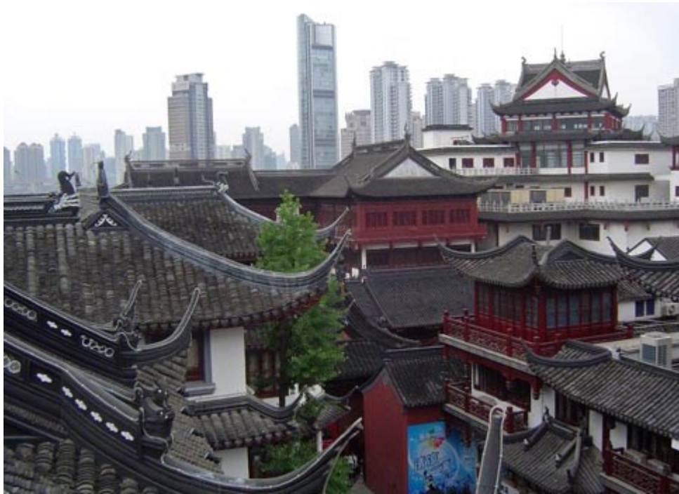
Rooftops of Old Shanghai and Modern Shanghai Office Towers.