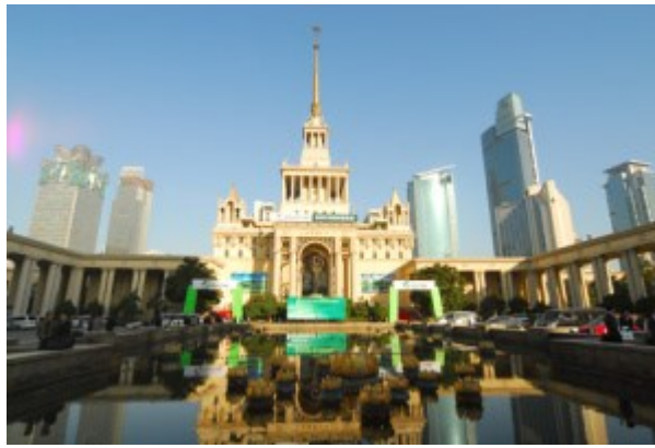
Shanghai Exhibition Centre, where Design Shanghai will take place

So our proprietor at Raffety Clocks will be in for an incredibly interesting time in China's most chichi city. If you bump into him at Design Shanghai walk onto the stand and you will be greeted with the sonorous melodies of a musical bracket clock with automata in the arch of the dial.