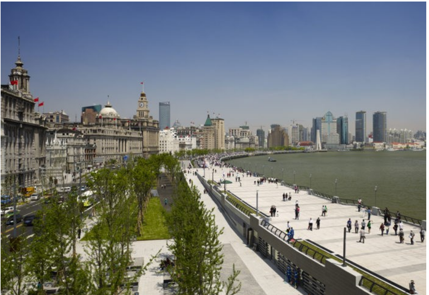
The Famous Bund in Shanghai.

Shanghai has the most amazing cityscape. It is almost something out of a science fiction film. For dazzling architecture you may see the huge Jinmao Tower, visit Yuguang Gardens and bazaar, Huzhou pagoda, and take a stroll around the back alley communities of Nantong. For museum culture you can look no further than Shanghai Museum of Art and History, the China Art Museum or the Shanghai Natural History Museum to name but a few. If Design Shanghai has exhausted you then take the road to Nanjing Lu which is the downtown Shanghai shopping district where you will feel quite at home with all the gorgeous glossy brands that you see in the West.