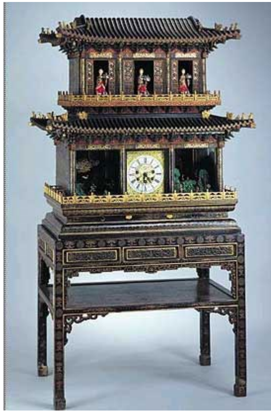
A Magnificent Automaton Clock, with English Clock Movement, in the Forbidden City Museum, Beijing.

The name Shanghai derives from the word ‘Shang’ meaning, ‘above’ and ‘Hai’ mean’s ‘Sea’, together meaning ‘Upon-the - Sea’. The earliest settlement dates from the 11th century where there was a town with this name in the area. Historians today have concluded that during the Tang dynasty Shanghai was literally on the sea, so hence the origin of the name.